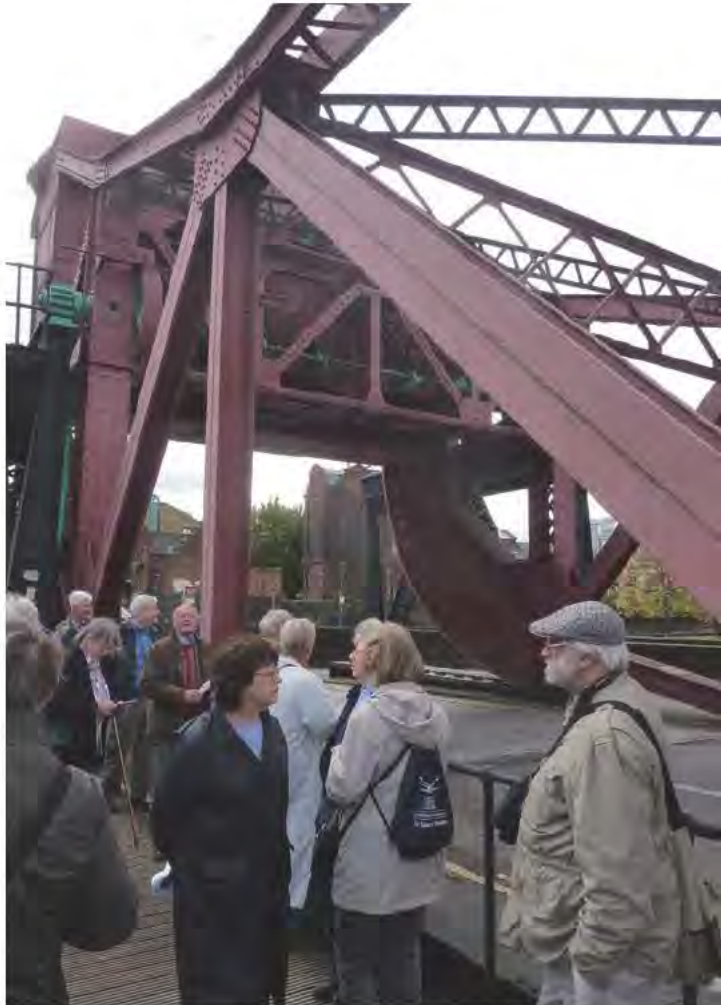
Shadwell Basin – the bridge gear (AB)

of the entrance, such as the harbourmaster's house, still remain; the entrance to the docks is now a garden square.