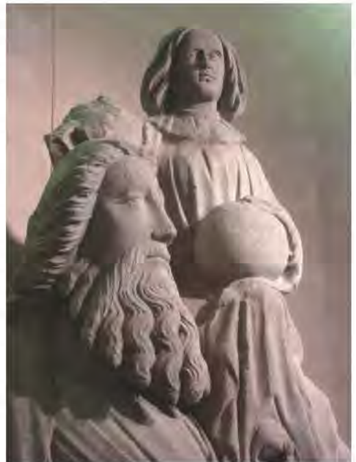
St Christopher