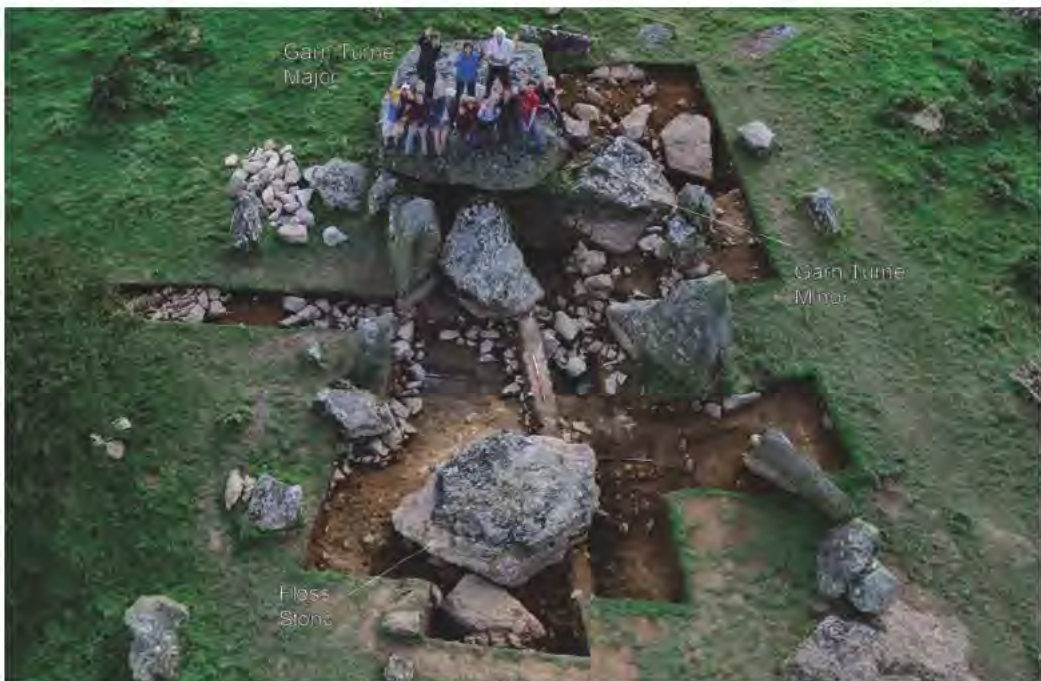
Garn Turne, Pembrokeshire

The main monument (GT Major) was constructed after both the quarrying of the Floss Stone and the construction of GT Minor. A large pit in the forecourt was almost certainly the original location of the 80-tonne capstone for GT Major. It was quarried, flaked into shape using massive hammerstones, and the pit from where it was dug partly backfilled. It was then elevated onto its supporting uprights, before collapsing, presumably due to sheer weight. Later, a forecourt of sorts was constructed, partly in the remains of the massive quarry pit. We also identified a series of standing stones nearby, demonstrating that this entire landscape had seen monumental construction.