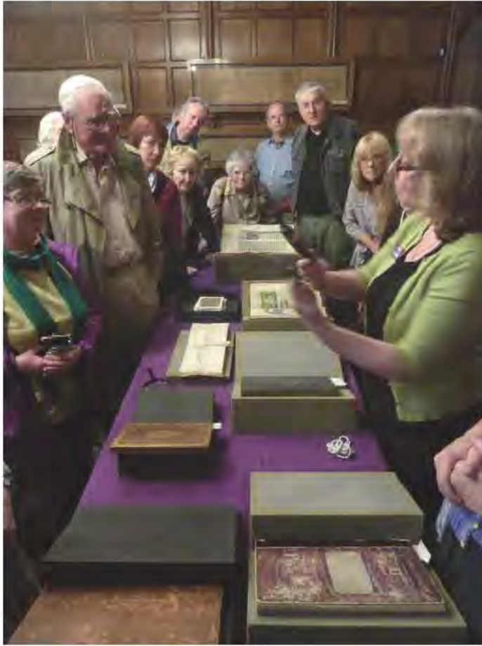
Viewing treasures of the Rylands Library (AB)

room, but regretted the demotion of the original imposing Deansgate Entrance Hall, with its John Cassidy statues of Theology Directing the Labours of Science and the Arts and noble grand staircase. Thankfully the original Victorian lavatories with generous seats remain. The staircase up to the fine Historic Reading Room, gives splendid views of the Entrance Hall below and the Lantern Gallery above. Cathedral-like, with double aisles, the Reading Room is built of many-shaded Cumbrian Shawk stone, with stained-glass windows, very white statues of the Rylands, and twenty other worthies gazing down at us. Linen-fold Polish oak panels, carved ceilings, bosses, faces in the radiator grilles, chairs with carved cotton flowers, drew our attention throughout. One of the first Manchester buildings electrically lit, its ornate bronze light fittings were coveted. Mrs R. and Champneys did not always see eye to eye. She insisted on an