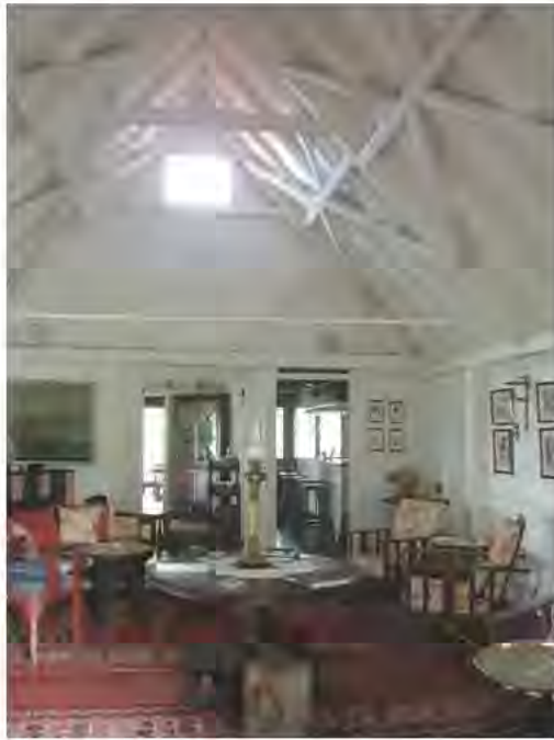
The open hall looking west (RHL)

also admirably suited to secure buildings against the high winds of the hurricane.