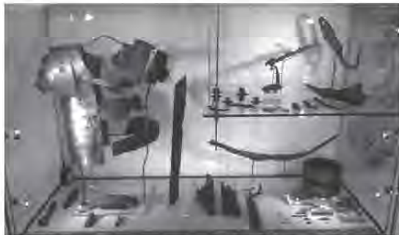
The Corbridge hoard's new display case

The Institute's Administrator will usually be at the Society of Antiquaries on the second Wednesday of each month from October to May, between 11 am and 3 pm. Her telephone number is [REDACTED], the email is admin@royalarchaeolinst.org and the postal address is RAI, c/o Society of Antiquaries, Burlington House, London, W1J 0BE.