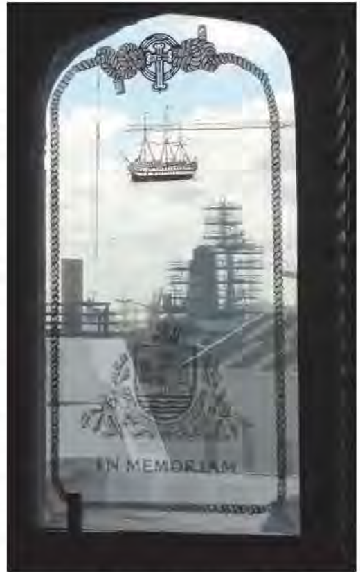
Cammell Laird's shipyard seen through HMS Conway memorial window