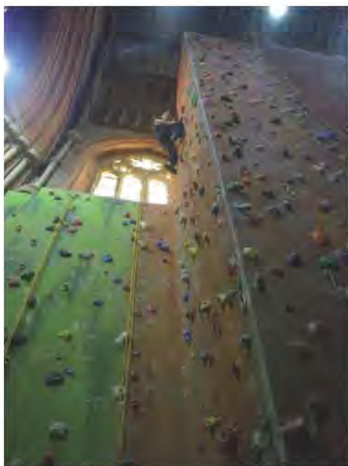
Climbing at St Werburgh's