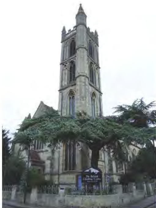
St Werburgh's, Bristol

Theories about Stonehenge abound. For me the question is less 'what was that common cultural activity?' as the Guardian suggests, rather 'is there enough evidence?' What, after all, is the significance of the setting midwinter sun and the rising midsummer sun shining through the heart of the monument? And there's the quote from Thomas Hardy ( Daily Chronicle , 24 August 1879), 'if a gale of wind is blowing, the strange musical hum emitted by Stonehenge