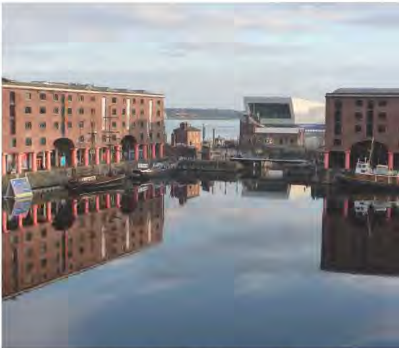
Looking north across Albert Dock to the Museum of Liverpool