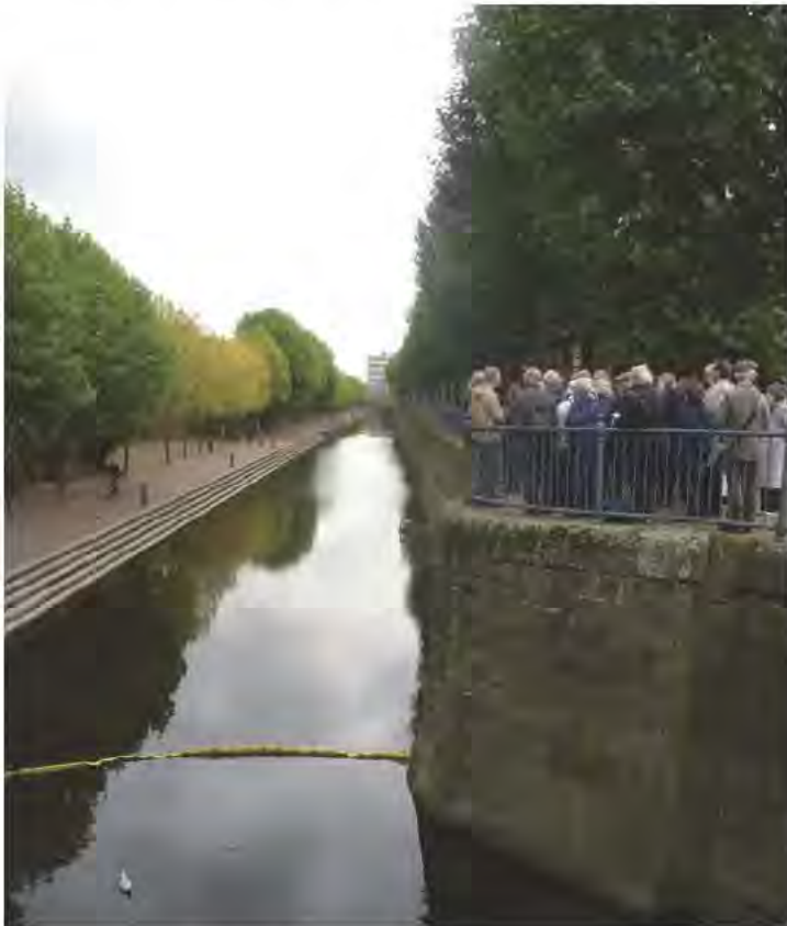
The length of the London dock preserved (AB)

directly on the quayside and warehouses behind. The Dock was badly bombed during the Second World War; little of the original remains. The Tobacco Dock Warehouse on the north side of the Dock still survives. For a brief period during the 1980s it had a life as a shopping centre but this did not prove viable. Following the Dock's closure, Tower Hamlets Council filled in the Western portion, upon which they intended to build social housing, but owing to financial constraints this did not happen. The London Docklands Development Corporation then acquired the land. On the north side is 'Fortress Wapping' where News International moved its print operations in the 1980s. Of the original dock basins only the Hermitage and Shadwell Basin survive. It is now difficult to appreciate the scale of this complex, though we could get some idea by walking alongside the sports field which now takes up what was the Wapping Basin part of the old complex. The Georgian houses for the dock staff on either side