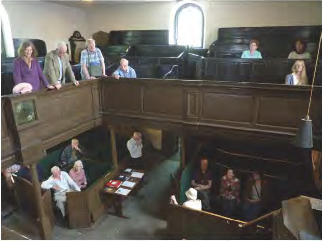
The Ancient Chapel of Toxteth