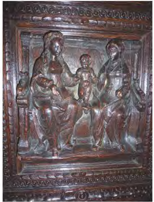
Chair back at Speke: The Virgin and St Ann with The Christ Child