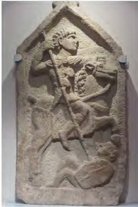
The cavalryman sculpture (AB)

present church is mainly of about 1200, much older than the Abbey. There are several Roman stones incorporated in the structure; we peered at a lintel that bore the name of one Flavius. In the churchyard are three interesting Saxon crosses, now dated to the tenth century, in varied degrees of preservation. The choir stalls have splendid misericords, three with inscribed text.