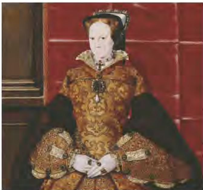
Mary I by Hans Eworth. Oil on oak panel, 1554 She sports jewels very similar to those in the Hoard.