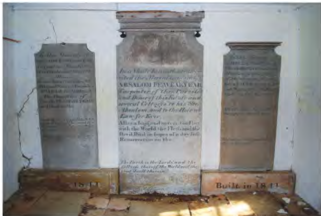
Inside the Feaveryear Mausoleum