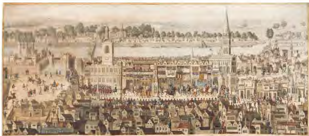
Coronation Procession of Edward VI by Samuel Hieronymus Grimm. Watercolour; 1785 This is one of the earliest images showing Cheapside and the various goldsmiths shops. The Society commissioned Grimm to copy it from the original mural at Cowdray House which was destroyed by fire in 1793. So, this watercolour is the only record of it.