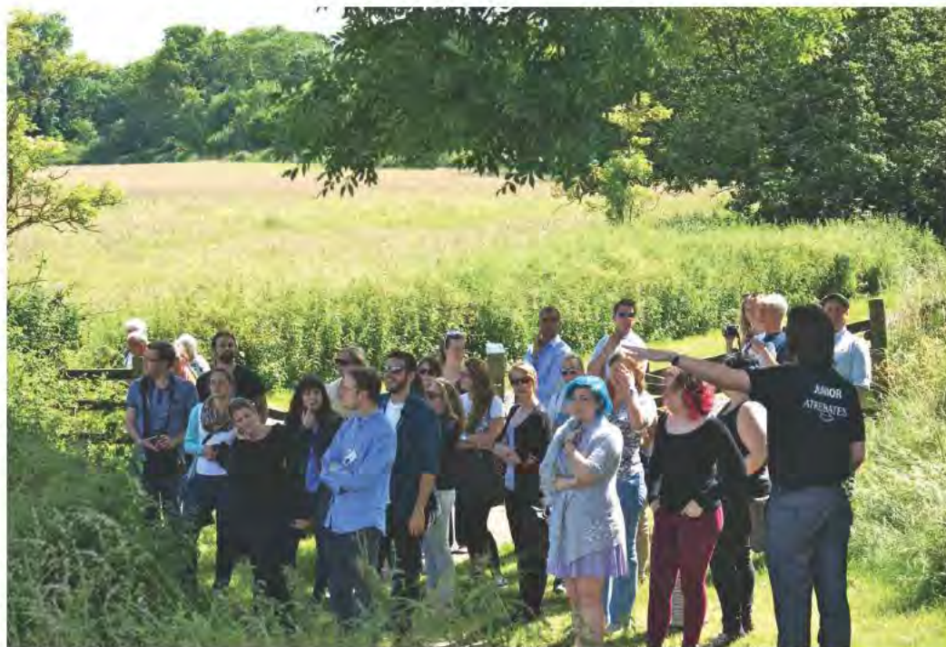
Exploring the amphitheatre at Silchester