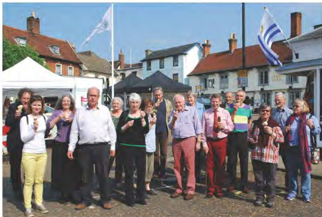
At Framlingham, Market Hill