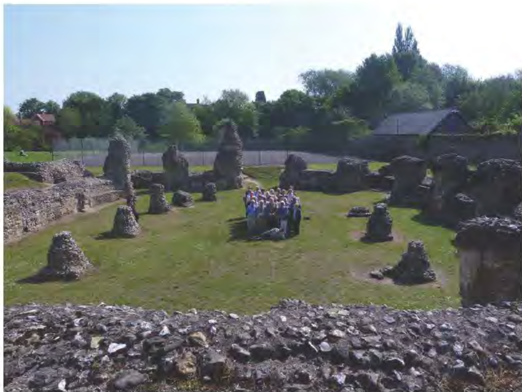
Marking the site of St Edmund's Shrine