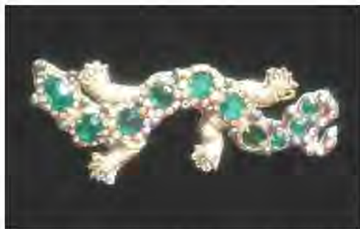
Salamander, gold, diamonds and emeralds: £12.66 (SL)

It was interesting to observe how the exhibition fuelled the desire to eat and shop.