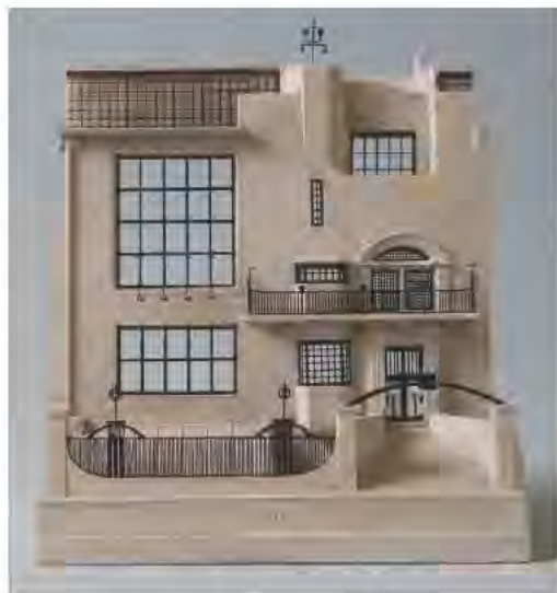
Glasgow School of Art North front. Plaster model by Timothy Richards

The Hunterian Museum is celebrating this research with the first substantial exhibition devoted to Mackintosh's architecture, including specially commissioned films and models together with over 80 architectural drawings, many never previously exhibited, and archival material rarely seen before. The exhibition focuses in particular on