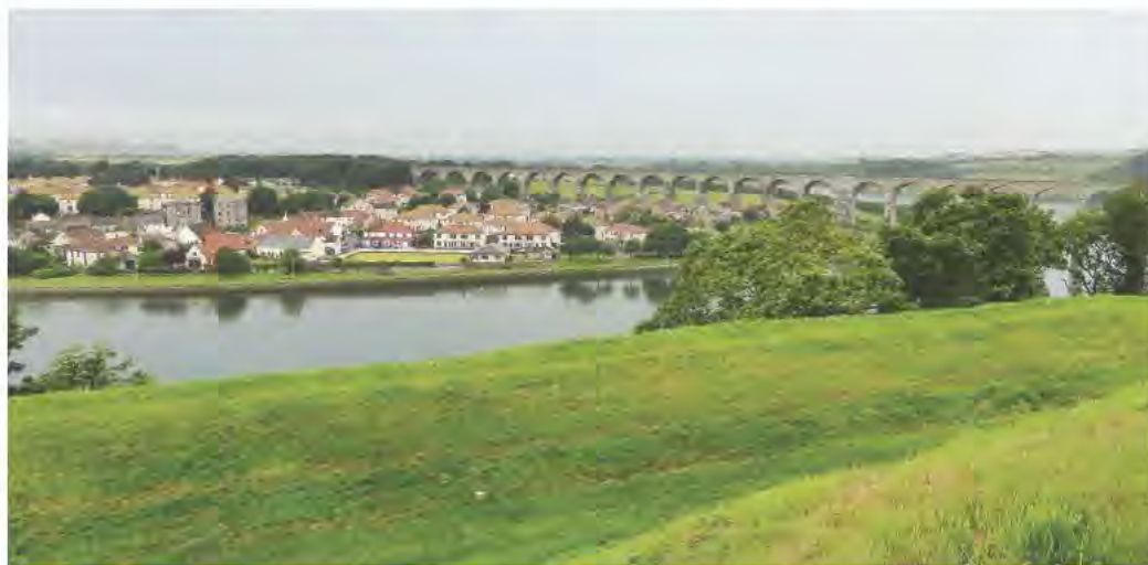
The Royal Border Bridge at Berwick-upon-Tweed (Ann Ballantyne)

The Royal Border Bridge at Berwick-upon-Tweed, seen from the coastline at Spittal, takes me home. It is a railway viaduct built under the supervision of Robert Stephenson in 1847 and the 720-yard span (659 m) with twenty-eight arches swings across the River Tweed into Berwick Station — cutting through the city fortifications. When seen from the train crossing the bridge it is a very elegant structure and pleasing to the eye.