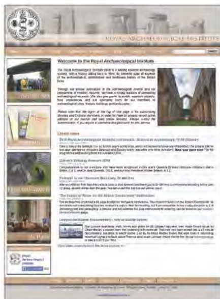
The home page of the RAI's website