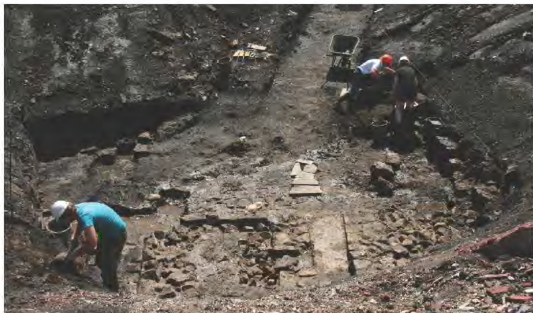
WallQuest at the newly-discovered Roman fort baths at Wallsend

In ‘Illuminating Commercial Archaeology: A Review of New Archaeological Discoveries from