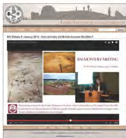
A page from the 2014 on-line debate