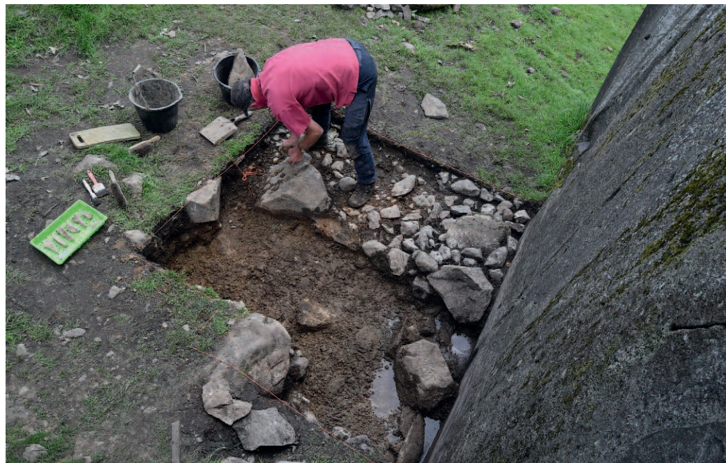
Copt Howe: the remains of the platform built against the principal decorated surface (A. Watson)

In 2018 small scale excavation was conducted at Copt Howe to shed further light on this problem. It showed that a platform had been built at the foot of the principal decorated surface and that its construction sealed two additional motifs with