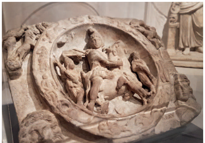
The tauroctony from the Mithraeum on display in the Museum of London (C. von Patzelt)

No expense has been spared to display the site and the finds from the 1950s and 2010–14 excavations in an elegant and informative way. As we wended our way down the stairs, we were literally going back in time, as was explained by graphics on the walls of the staircase. In the ruins themselves an 'immersive' sound and light display introduces visitors to the cult of Mithras and to the Walbrook Mithraeum. This is a very modern