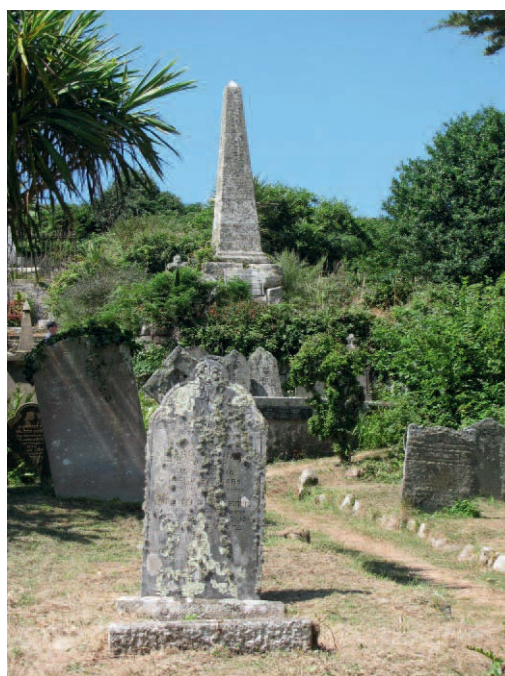
Memorials to Scillonians and the shipwrecked

Further notes can be seen via the RAI's Events webpage.