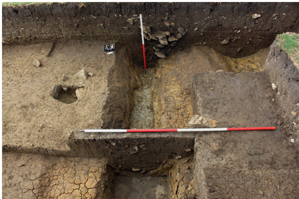
Hanging Grimston: the ladder settlement looking south: ditch 1 far right (west), ditch 2 by vertical scale, and ditch 3 (re-cut) by the stone in section, with 'berm' in the natural clay beneath corresponding to the base of the re-cut