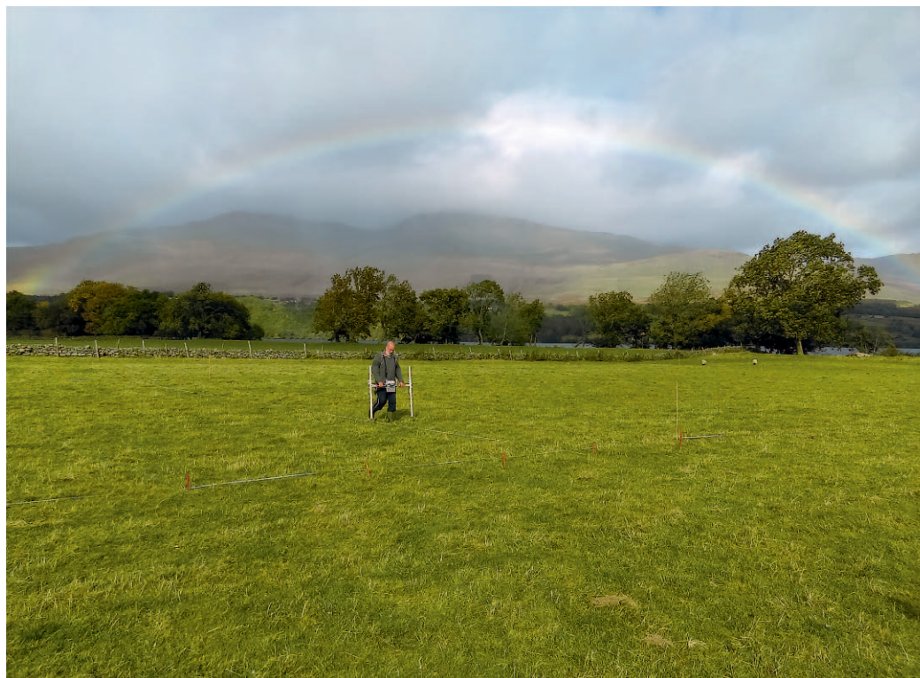
D. Hamilton surveying at Loch Tay (M. Stratigos)

carried out on 3.2 ha over three sites along the loch shore. Test trenches over anomalies confirmed them as post-medieval features, and uncovered no evidence for later prehistoric archaeology, apparently a true representation of the surviving archaeology. Additionally, geophysics was undertaken over two purported ring-ditched houses at Easter Croftintygan (situated on the terraces above the north shore). The geophysical survey showed clear positive results. Test trenches in the better preserved of the two houses revealed relatively shallow stratigraphy in its interior with the remnants of a hearth and small pit feature, but also the potential for a considerable depth of remains in the ring ditch surviving beneath the collapsed wall debris.