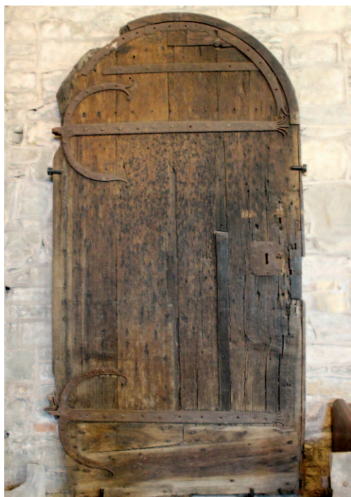
The Laneham door is affixed to the west wall of the nave (R. Sheppard)

numerous Romanesque features and apart from the west tower which has been renovated in the Perpendicular style, the only other major structural addition is the Early English arcade opening onto the north aisle. Two items of oak furniture were tree-ring dated by Oxford Dendrochronology Laboratory: the former south door, now displayed on the west wall of the nave, and a clamped chest