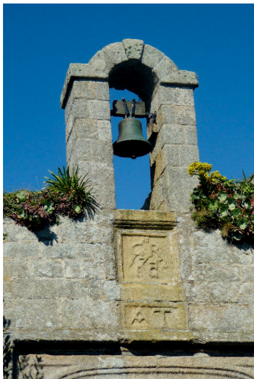
Detail of the bell-cote and parapet of the Garrison Gate as remodelled (1742) by Abraham Tovey, resident master gunner (the initials are of King George II, Francis Godolphin, and Tovey). (M. O'Brien)

The Star Castle, begun in 1593, was our base for six days. It is formidable in appearance, with projecting bastions to give interlocking fields of fire. There is a substantial magazine and some surviving barrack buildings. It makes an excellent hotel, but a poor fortress; in its present role, it is wonderfully picturesque. In the sunshine and clear air of a flawless week in July, the islands took on a Mediterranean or even a Caribbean appearance, but however commanding the castle may look on its promontory above the harbour, its construction must have been too flimsy to withstand a serious