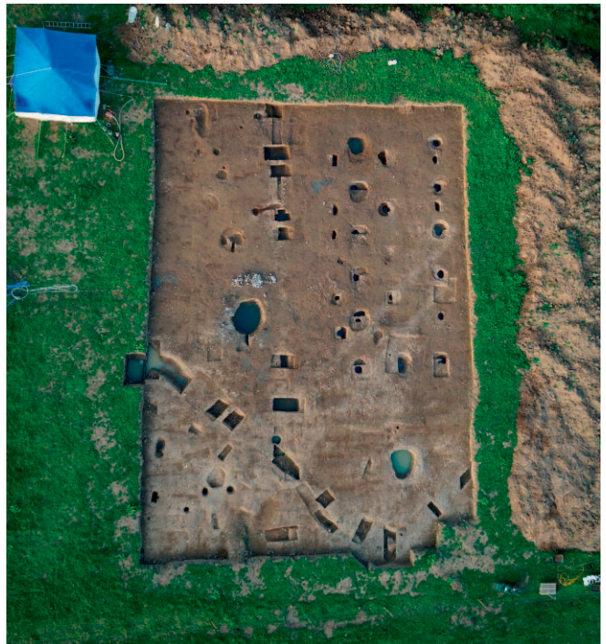
Culver: drone image of the completed excavation, 2014

These samples were initially processed on site using a SIRAF flotation unit with the >4 mm residues investigated for organics. These were subsequently sent together with the floating material (flots) collected by 300 µm mesh for specialist analysis. The results provided valuable information