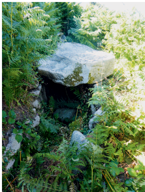
Halangy Porth Bronze Age burial chamber

Halangy Down settlement, although difficult to spot, as it was subsumed in bracken.