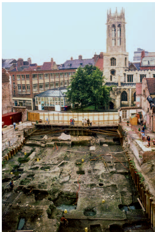
View north over the Coppergate site in full swing.

To record and celebrate the experience that was the excavation YAT is now running a Coppergate Memories project and I am delighted to have been able to record my thoughts on the site for posterity. It's odd to think that my experiences – which sometimes feel as if they were only yesterday – now form part of an oral history project ! The search for new contributions continues; (search for coppergate-memories for further details). Coppergate had a deep impact on both my professional