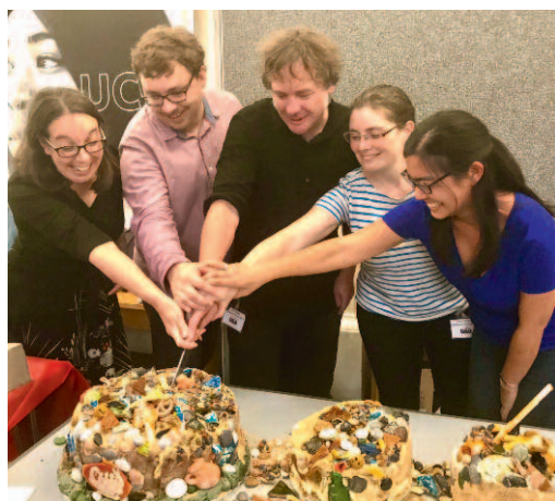
TDP staff past and present cutting the cake