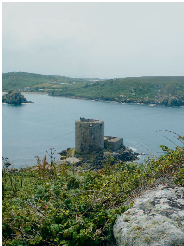
View S-W over Cromwell's Castle and across the channel between Tresco and Bryher (A. Williams)

its north end containing a fireplace with bread oven. Two smaller chambers, north and south of the main room were probably sleeping quarters and to the east lay the guard room.