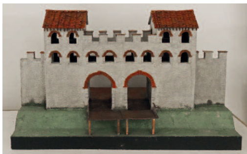
Londinium: model of the west gate of the fort and city

After admiring the displays of marble sculpture from the Mithraeum and neighbouring temples, we ended an excellent morning with lunch at Benugo's at the Museum of London. This may be the last time that the RAI visit the Museum of London before it is bodily lifted to its new site at Smithfield. Somehow, given that we had spent the morning visiting archaeological sites that have been moved around, it seemed only reasonable that the Museum should also continue on its journey around our capital. Many thanks are due to Caroline Raison for organizing and Hedley Swain for leading us on a fascinating and thought-provoking tour.