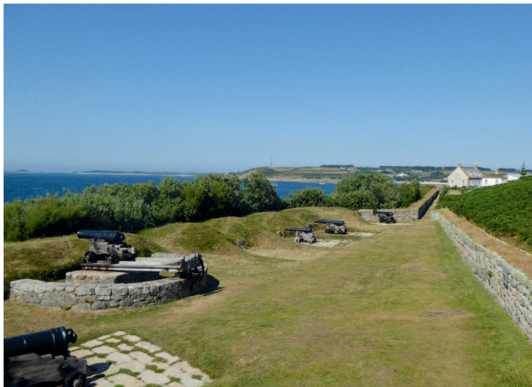
Garrison Walls: view N-E across King Charles' Battery, with reconstructed turf bank and replica gun carriages

the outbreak of war with France. Some cannon have been mounted to give an impression of its appearance, and a reconstructed traversing platform shows how the guns could be laid to cover the approaches to the island. Throughout the nineteenth century and during the two World Wars, the defences were constantly updated to include rifled breechloaders and electric searchlights, but they saw little, if any, action. The murderous rocks and shoals around the islands must have destroyed far more ships than were ever damaged by the shore-based artillery, without distinction of friend or enemy.